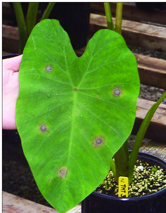
Leaf being inoculated with Phytophthora

New clones with commercial potential are: H91-4392, H92-5867 and H93-6002 for the Makaweli soil on Kauai; H79-6503 and H90-7435 for the rocky, dry areas on Maui; H82-3569 and H83-4501 for the sandy areas on Maui; H82-3569, H85-4501, H85-1605, H86-3792, H87-4394 and H88-6401 for windward Maui. H87-5794 had the best FT7 records in the leeward region and H87-4319 performed well in mill water fields.