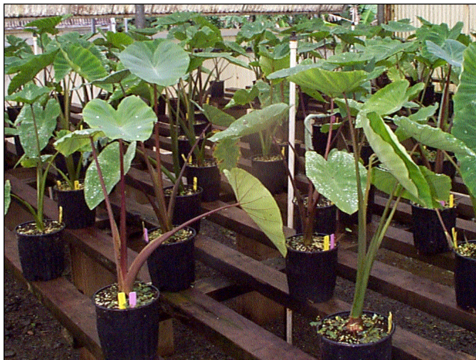
Potted taro plants