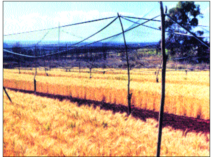
Wheat maturing in a winter grow out

Several crops were grown at the Kunia Substation for winter nursery, seed production, growout and research. Most temperate, subtropical and tropical crops can be grown year round at Kunia with its mild average temperature and only 9°F difference in high temperature between January and July, and daily diurnal temperature difference of 10 to 15°F. The average annual solar radiation intensity is 250 watts per square meter and the sunlight in December is 60% of that in July. The longest and shortest day lengths are 13.5 and 11 hours. Supplemental lighting was provided to grow long day length crops during the winter periods. The annual long-term rainfall total is 27 inches with most occurring during November through February. All fields are drip-irrigated.